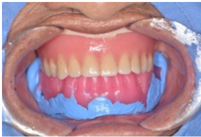
4 Wax Denture put in mouth and check the bite.