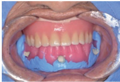
5 Attach marker or flow resin on the buccal of Wax Denture.