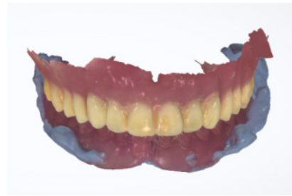
6 Scanning opposite arch, Bite, Inner & Outer surface of Wax Denture.