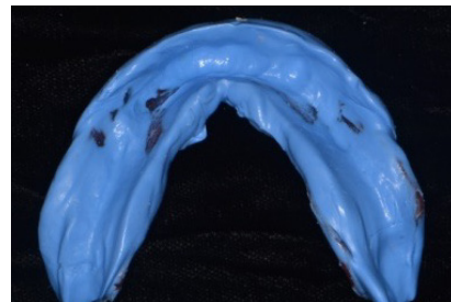
3 Insert Impression material to the inner surface of Wax Denture.