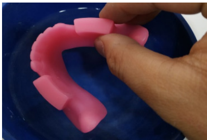
1 Put during 10s in hot warter.