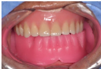
2 Align the inner surface to the patient's mouth.